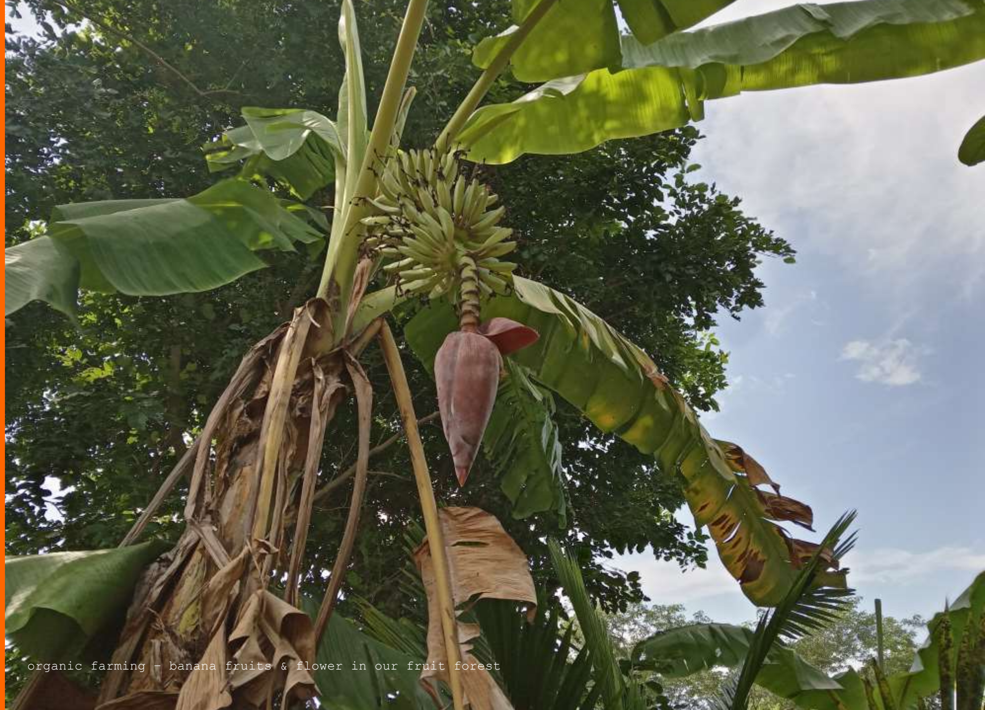
organic farming – banana fruits & flower in our fruit forest