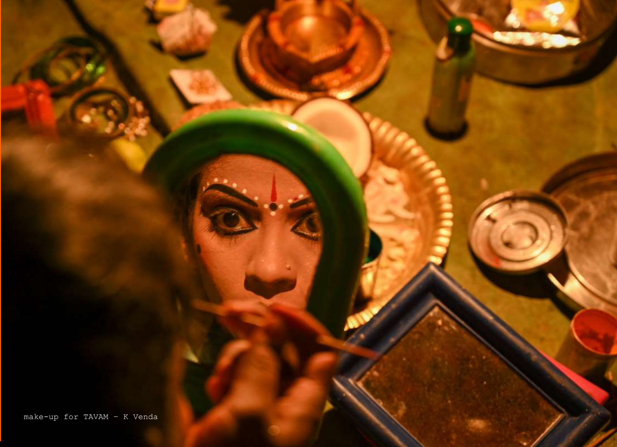
make-up for TAVAM - K Venda